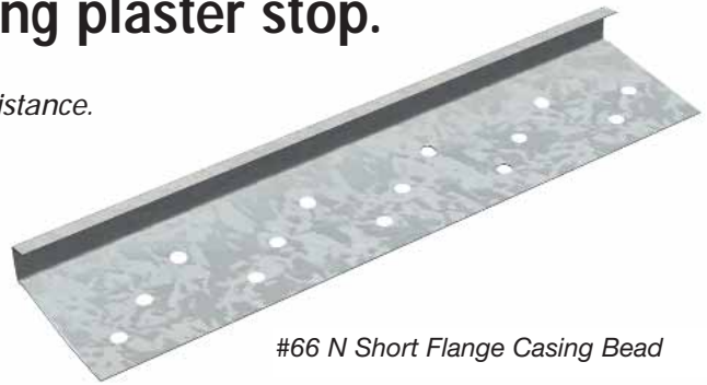
#66 N Short Flange Casing Bead

Dietrich #66 N short flange casing beads are used as plaster stops, as exposed trim around wall openings and junctions, or at intersections of plaster and other wall or ceiling finishes. These casing beads are recommended for gypsum plaster bases. Perforated 1-1/4" nailing flange aids attachment and plaster keying. Short flange 7/8" beads are recommended when flange is applied under gypsum lath plaster base, and short flange 1/2" beads when flange is applied over gypsum lath plaster base. Zinc is recommended for exterior applications.