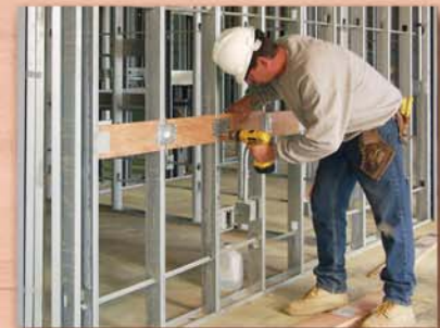
Secure each plate to the stud flange using 2 small pan or wafer head screws.

Danback® Trimables for off-module backing.