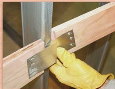
Overlap connector plates when using in long backing runs.