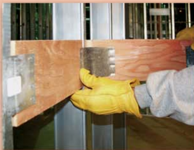
Repeat the process.