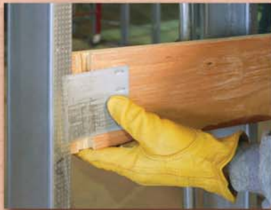
Snap "Starter Edge" into the open side of the stud flange.