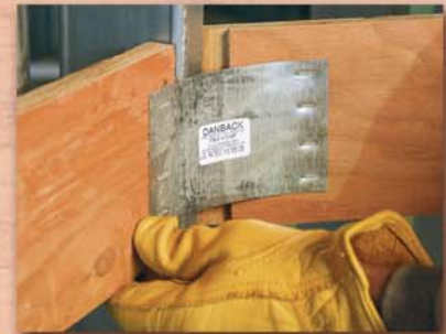
Flex Danback® Flexible Wood Backing around stud flange using the flexible connector plate.