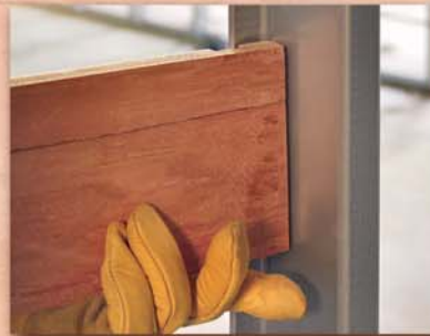
HINT: Start with the first full bay. Use Danback® Trimables for off-module bays.