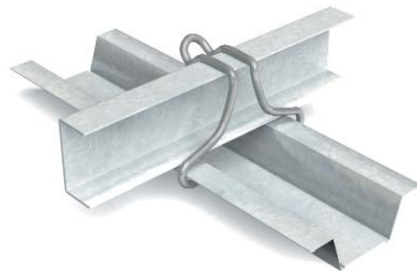
Furring Channel Clip