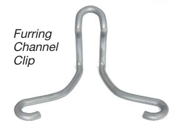
Furring Channel Clip

For more information or to contact a sales representative, see page 3.