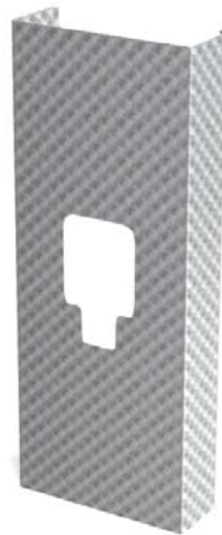
1-1/2" wide knockout in 3-5/8" and wider studs

Dietrich UltraSTEEL® studs for interior nonload-bearing, nonstructural framing are pre-punched with knockouts at regular intervals. These punch-outs are specifically designed to allow for the rapid installation of pipes, electrical conduit, wiring and bridging.